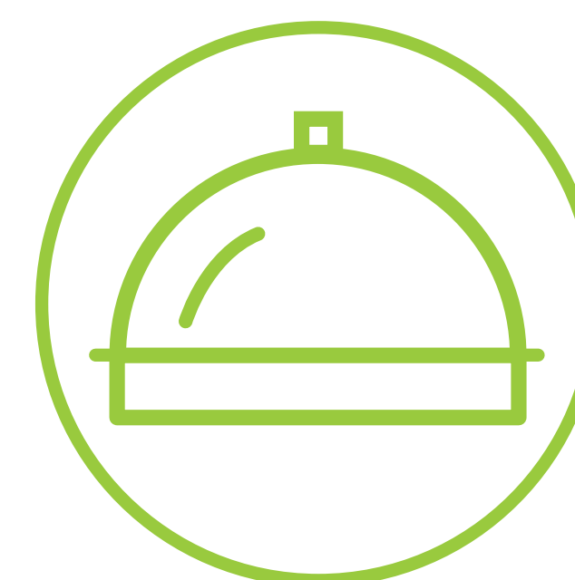
Food cover/ Sneeze guard