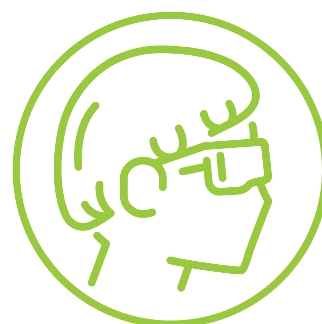
Hair Confinement (beard net as needed)