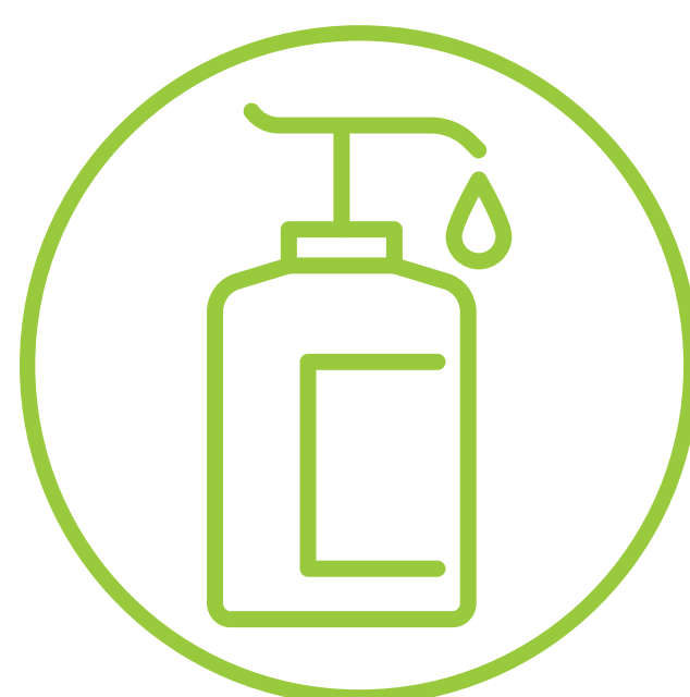
Hand washing & sanitation kits