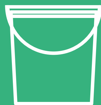
2+ gallon bucket to catch gray water